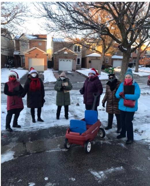
Some of St. John's choir members ready to go carolling and collect food donations!