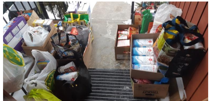
Food donations that were dropped at Carmen's house.