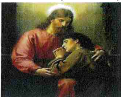
"Well done, my good and faithful servant" Matthew 25:21