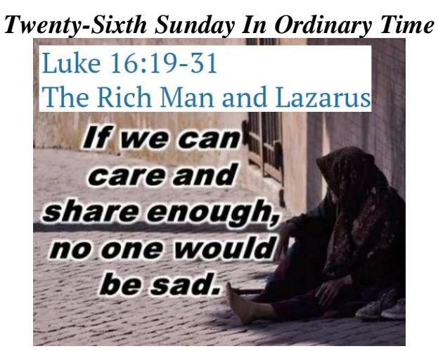
"There was a rich man who was dressed in purple and fine linen and lived in luxury every day. At his gate was laid a beggar named Lazarus, covered with sores and longing to eat what fell from the rich man's table. Even the dogs came and licked his sores"